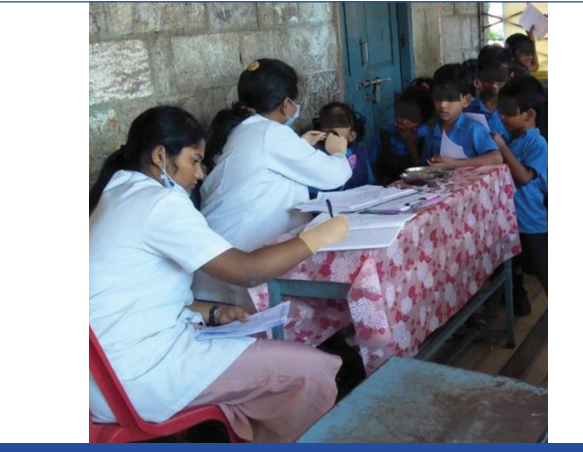
[Table/Fig-3]: Clinical examination.